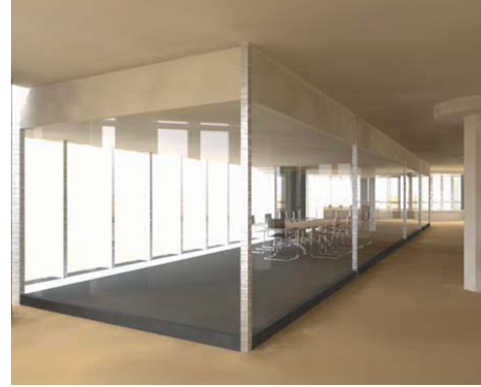
Figure 2. Demonstrator: Future Workspace

The energy consumption of the overall system is the sum of the used bus-devices, the loss on the communication lines and the loss at the high efficient main power supply. For a